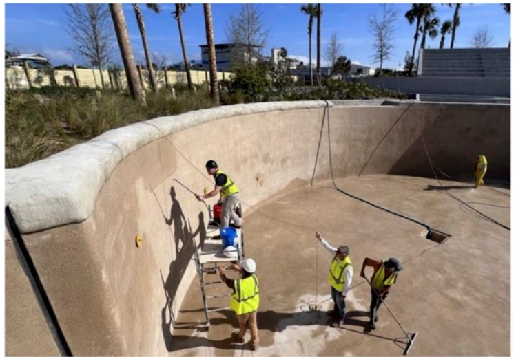
Commercial Protection for Residential Pools: MicroGlass Protects this One Million Gallon Saltwater Dolphin Habitat, Fort Walton Beach, FL. Did you know your pool surface faces similar harsh chemical environments that requires additional protection?

MicroGlass hardens the cement that holds your pebble and quartz in place.